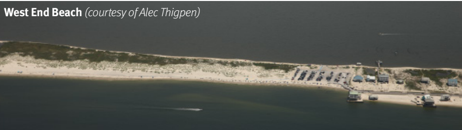
West End Beach

The Town of Dauphin Island, through funding from the National Fish and Wildlife Foundation Gulf Environmental Benefit Fund (NFWF GEBF), has completed preliminary engineering and design to restore beaches and dunes along the West End of Dauphin Island. Through GOMESA funding the engineering and design team will be completing a full design and permitting of a multi-phased project. Project activities completed to date include 30% design, design phase alternatives analysis, modeling, and field investigations to inform full design parameters. The permitting process will commence in the fall of 2024. Funding opportunities for construction are being