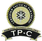
TROY GORLOTT NREMT-P TP-C PUBLIC SAFETY SUPERVISOR TOWN OF DAUPHIN ISLAND " ALWAYS READY "

As of March 1 the rip current flags at our beaches are being flown and conditions monitored. Daily updates will be posted on the Public Safety Facebook page as well on the Town of Dauphin Islands App.