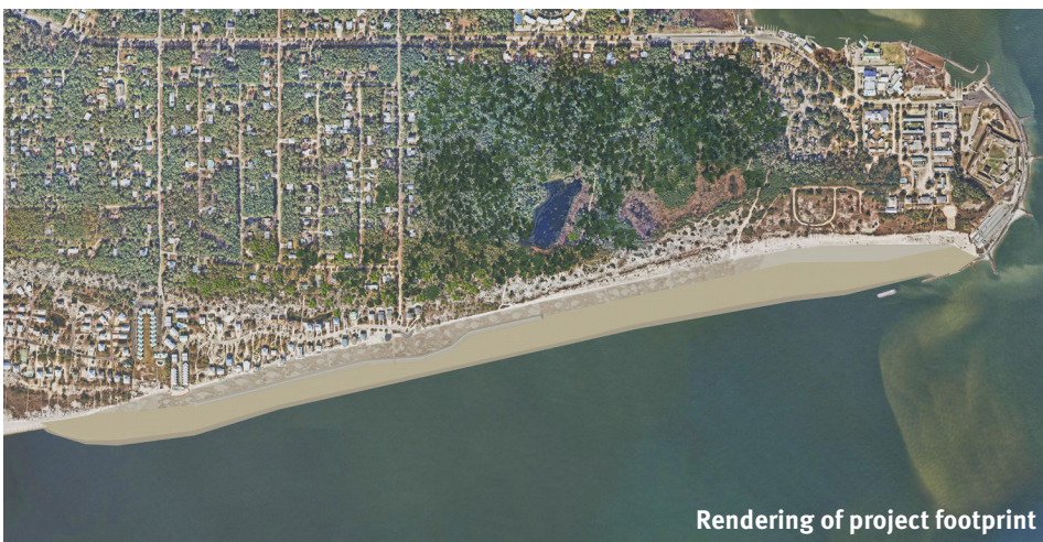
Rendering of project footprint

The East End Beach and Dune Restoration Project team has secured a qualified contractor to bring a million cubic yards of sand to the east end of the island, restoring our beach and dune habitats. The USACE/ADEM and ADCNR permits have been received (August 2023). The project, once constructed, will extend from East End Public beach to half way through DeSoto Landing neighborhood.