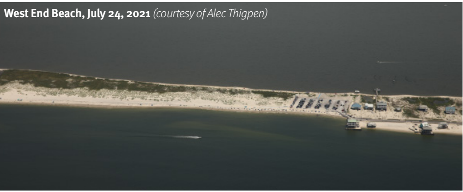
West End Beach, July 24, 2021

The Town of Dauphin Island has successfully secured funding from the National Fish and Wildlife Foundation Gulf Environmental Benefit Fund (NFWF GEBF) to conduct preliminary engineering and design activities as Phase I of a multi-phase restoration effort to restore beaches and dunes along the West End of Dauphin Island. The West End of the island has experienced tremendous shoreline retreat over the past several decades. This project focuses on nourishing the most vulnerable reach of the West End – mid Island to Katrina Cut (see below).